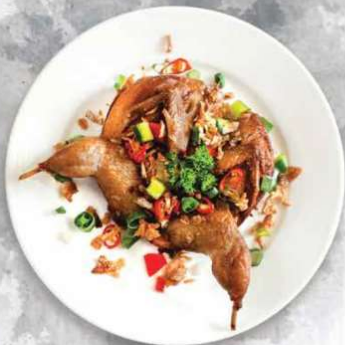
椒鹽鹉鴉 Deep-Fried Five Spice Quail