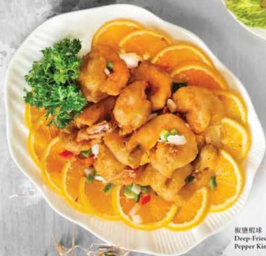
椒鹽蝦球 Deep-Fried Chilli Salt & Pepper King Prawns