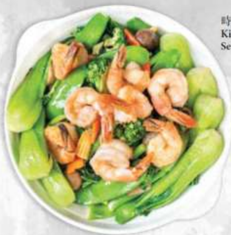
時菜蝦球 King Prawns with Seasonal Vegetables