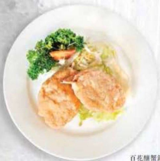
百花釀蟹鉗 Stuffed Crab Claw