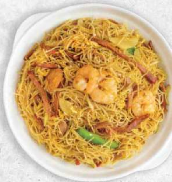
星洲炒米 Singapore Noodles

鮮蝦臘腸炒飯 Chinese Sausage & Prawn Fried Rice $29.50