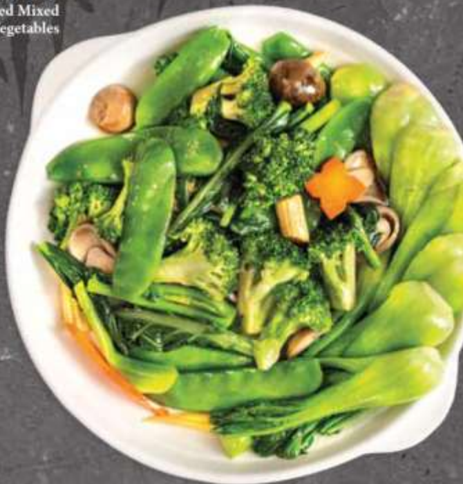
清炒雜菜 Stir-Fried Mixed Seasonal Vegetables