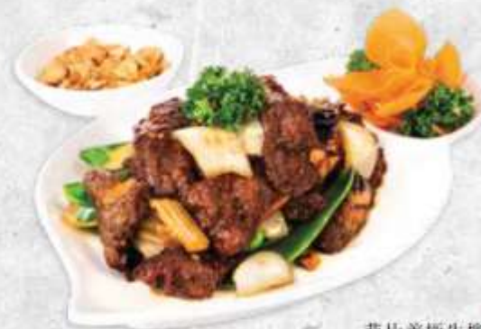
蒜片美極牛柳 Beef Fillet in Maggi Soy Sauce with Garlic