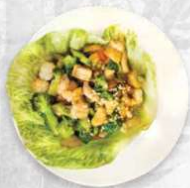
海鮮生菜包 Seafood San Choi Bao