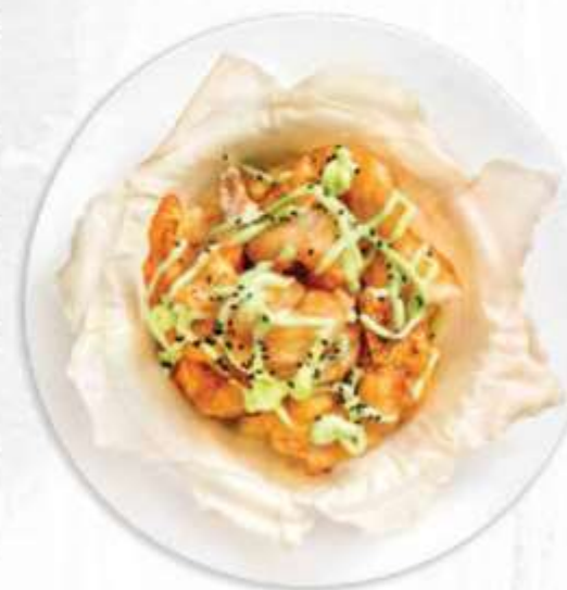
日本芥辣蝦球 King Prawns in Japanese Wasabi Sauce