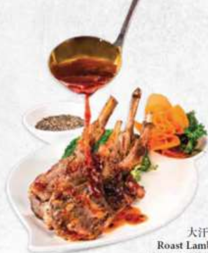
大汗羊扒 (四件) Roast Lamb Chop with Leek & Five Spice (4pcs)

金輝海鮮巢 Gold Leaf Seafood Combination Basket $40.80