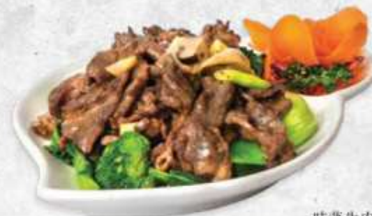
時菜牛肉 Stir-Fried Beef with Seasonal Vegetables