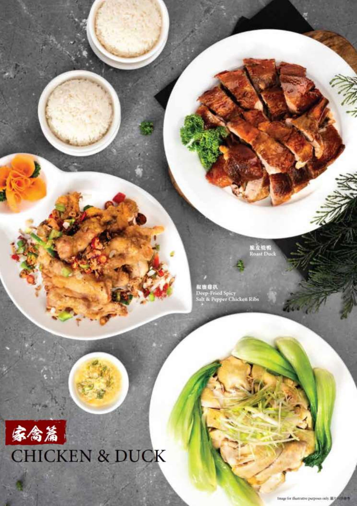
脆皮燒鴨 Roast Duck