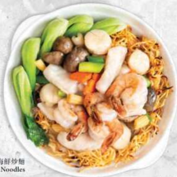
海鮮炒麵 Seafood Combination Fried Noodles