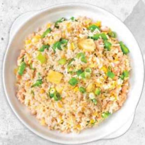
菠蘿雞粒炒飯 Chicken & Pineapple Fried Rice