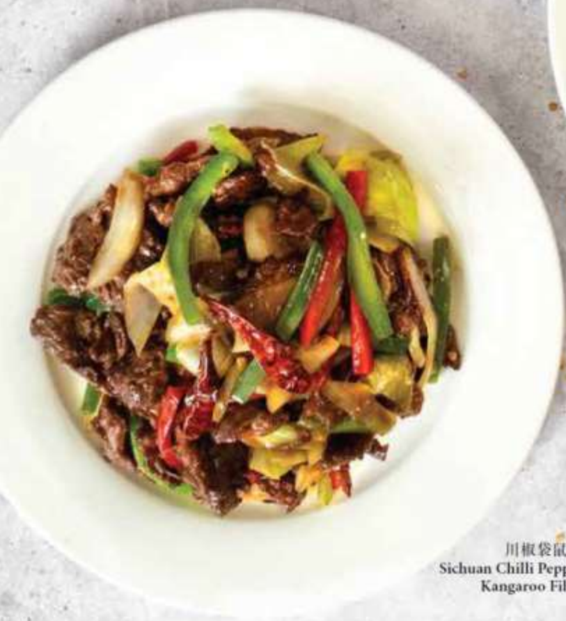
川椒袋鼠肉 Sichuan Chilli Pepper Kangaroo Fillet

XO醬炒鱷魚肉 Crocodile Fillet in Gold Leaf XO Chilli Sauce