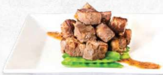
黑椒和牛粒 Pan-Fried Diced Wagyu Beef in Black Pepper Sauce