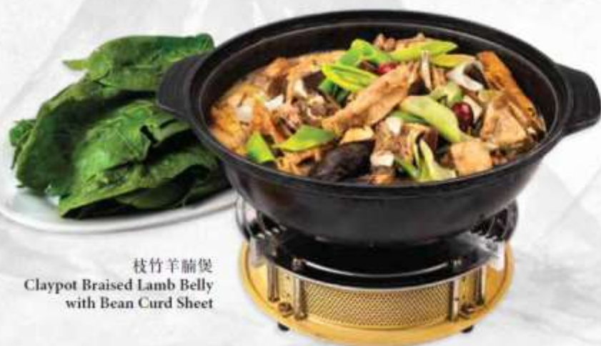
枝竹羊腩煲 Claypot Braised Lamb Belly with Bean Curd Sheet