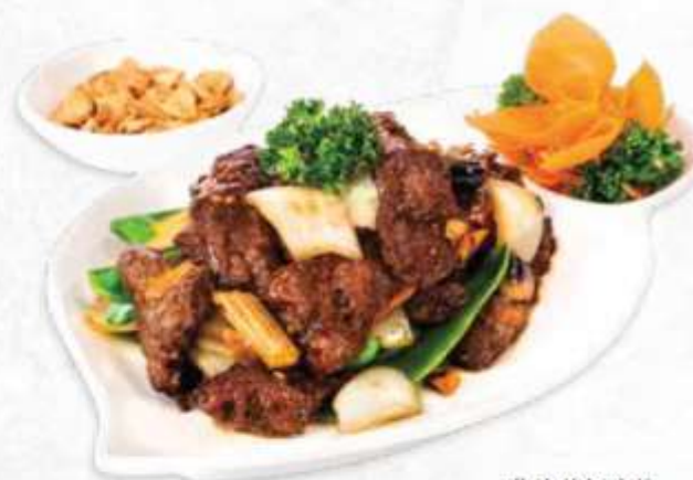
蒜片美極牛柳 Beef Fillet in Maggi Soy Sauce with Garlic

鵝肝醬珍寶蝦 King Prawns in Foie Gras Sauce $42.00