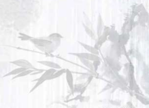
清蒸新鮮生蠔 Steamed Fresh Oysters