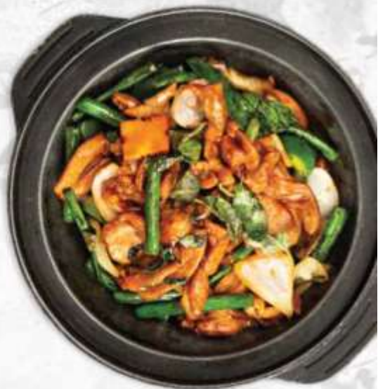
三杯雞球煲 Boneless Chicken in 3 Wines Sauce

廚師推介 RECOMMENDED CHEF'S SIGNATURE DISHES