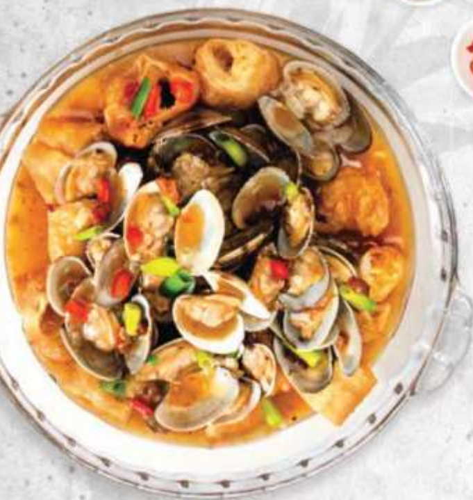
XO醬炒蜆 (附油條) Pipi (Clam) in Gold Leaf XO Chilli Sauce with Chinese Donuts