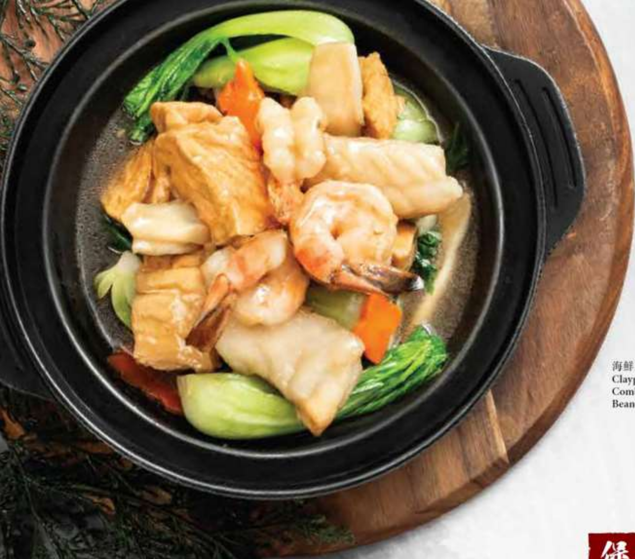
海鮮豆腐煲 Claypot Seafood Combination & Bean Curd