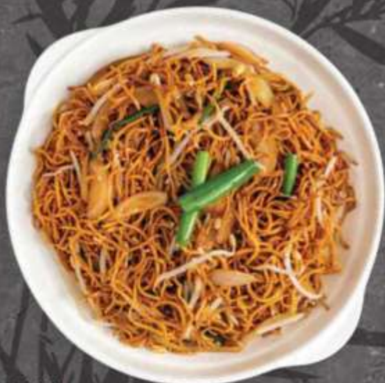
豉油皇炒麵 Supreme Soy Sauce Fried Noodles