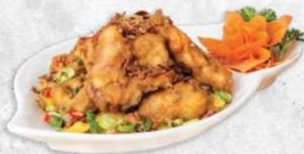
椒鹽肉排 Deep-Fried Spicy Salt & Pepper Pork Cutlet