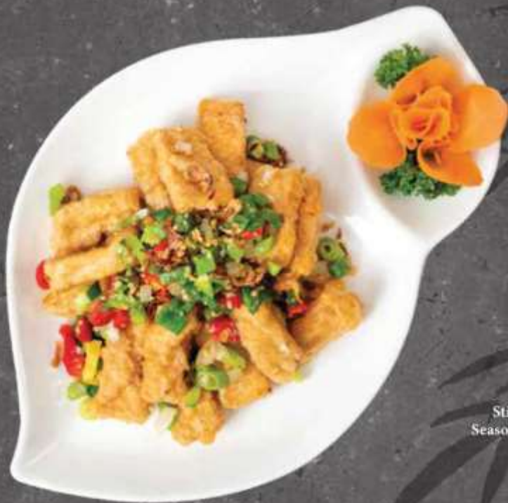
椒鹽山水豆腐 Deep-Fried Spicy Salt & Pepper Bean Curd