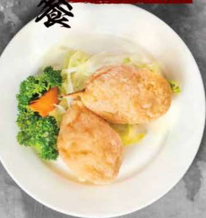
百花釀蟹鉗 Stuffed Crab Claw